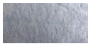
Level 4: Heat Sealed Stitching