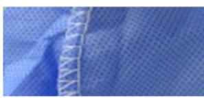
Level 2 : High Intensity Stitching