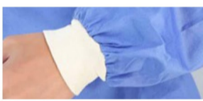
Knitted Cuffs (Optional)